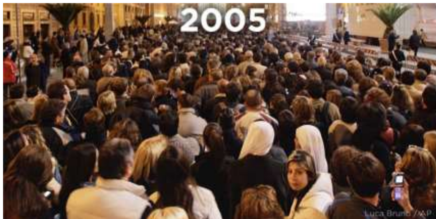
Páfinn predikar í Vatikaninu 2005