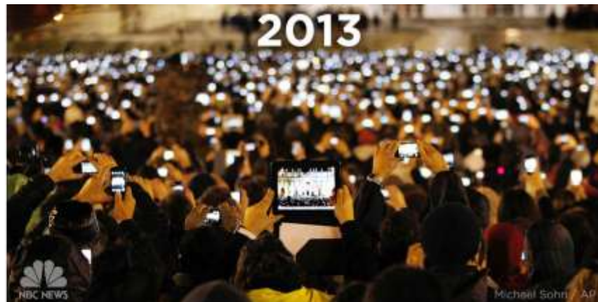
Páfinn predikar í Vatikaninu 2013